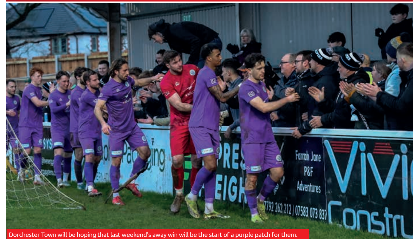
Dorchester Town will be hoping that last weekend's away win will be the start of a purple patch for them.

Top of the table, Walton & Hersham, had to settle for a share of the spoils in their last game as Bracknell Town grabbed an equaliser deep into stoppage time. They still lead the way by seven points as they head to Hungerford Town at the weekend. Their hosts are desperate for the points to pull themselves out of the bottom four.