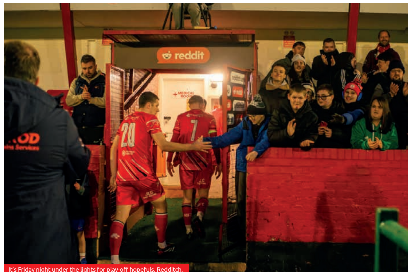
It's Friday night under the lights for play-off hopefuls, Redditch.

"Like always, we need that extra support to help drive us on and hopefully our fans will grab a mate and bring them along for a good Friday night out with us.