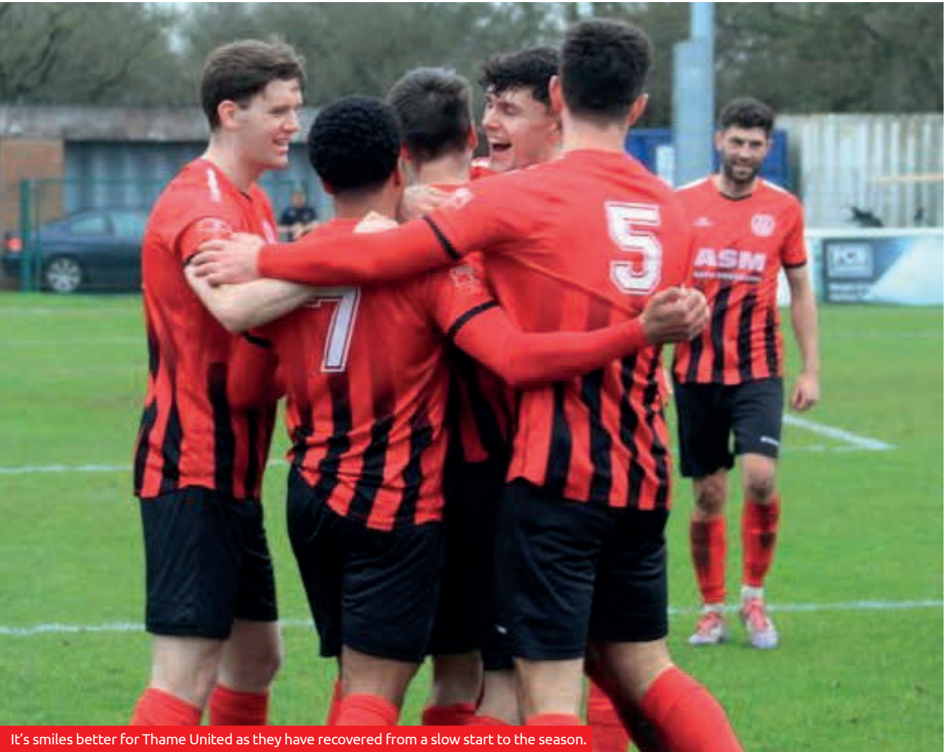
It's smiles better for Thame United as they have recovered from a slow start to the season.

"We're really looking forward to the run-in and being able to play