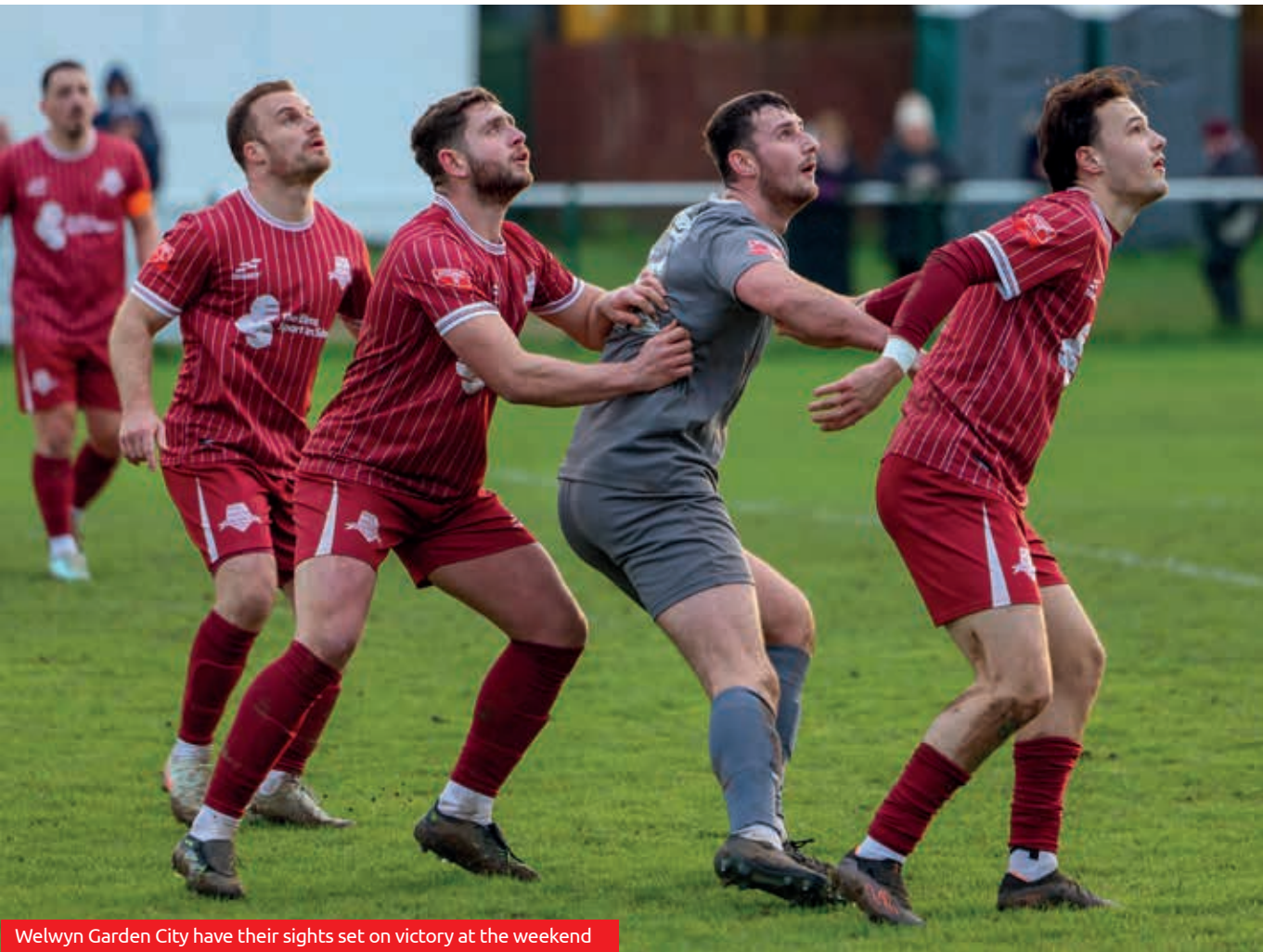
Welwyn Garden City have their sights set on victory at the weekend

The winter weather has been the winner in recent weeks, but leaders, Leighton Town, will be hoping to strengthen their place in pole position as they head to Marlow, who are in the lower half of the table.