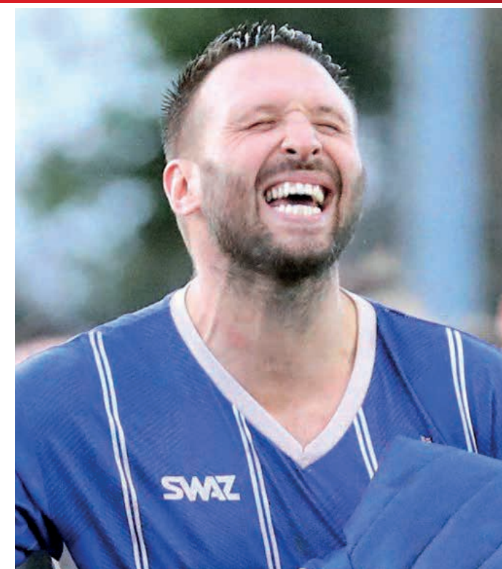
Will Exmouth Town still be smiling come the final whistle on Saturday?

Elsewhere, Exmouth Town will be looking to keep their play-off hopes alive as they entertain Falmouth Town. In the middle of the table, Larkhall Athletic take on Sporting Cub Inkberrow, who are seeking a response after they fell to a 3-1 defeat at Swindon Supermarine on Monday night.