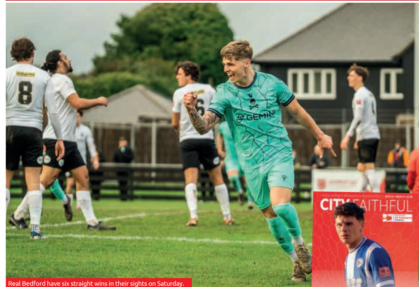
Real Bedford have six straight wins in their sights on Saturday.

Spalding United currently hold a four-point lead at the top of the table. They are at home this weekend as they face an Alvechurch side who sit just outside of the bottom four, so this will be an encounter which affects both ends of the table.